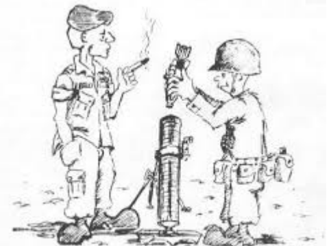
"Say fellow, let's you and me have a little talk."